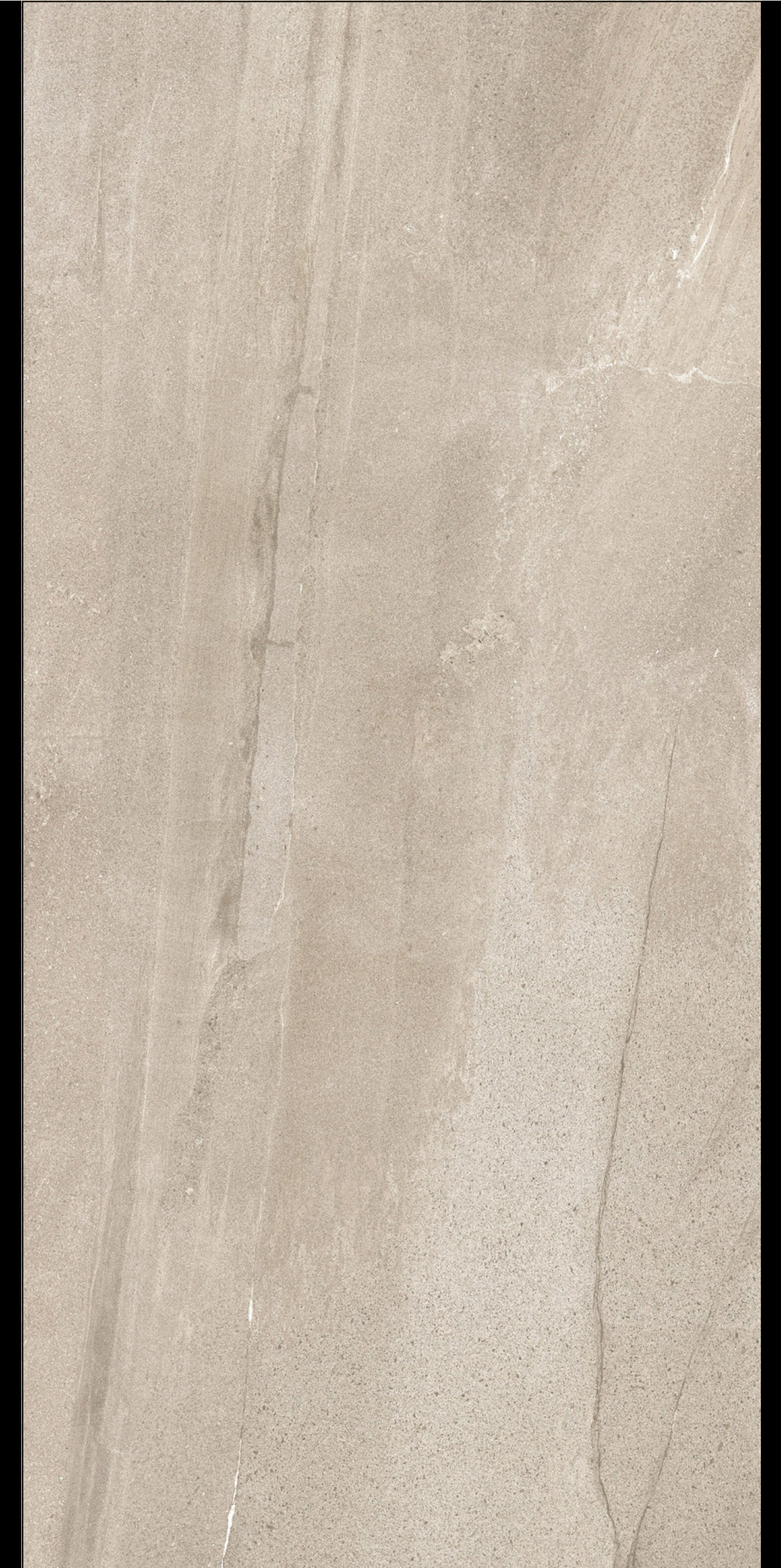
Basalt Stone Sand Basalt