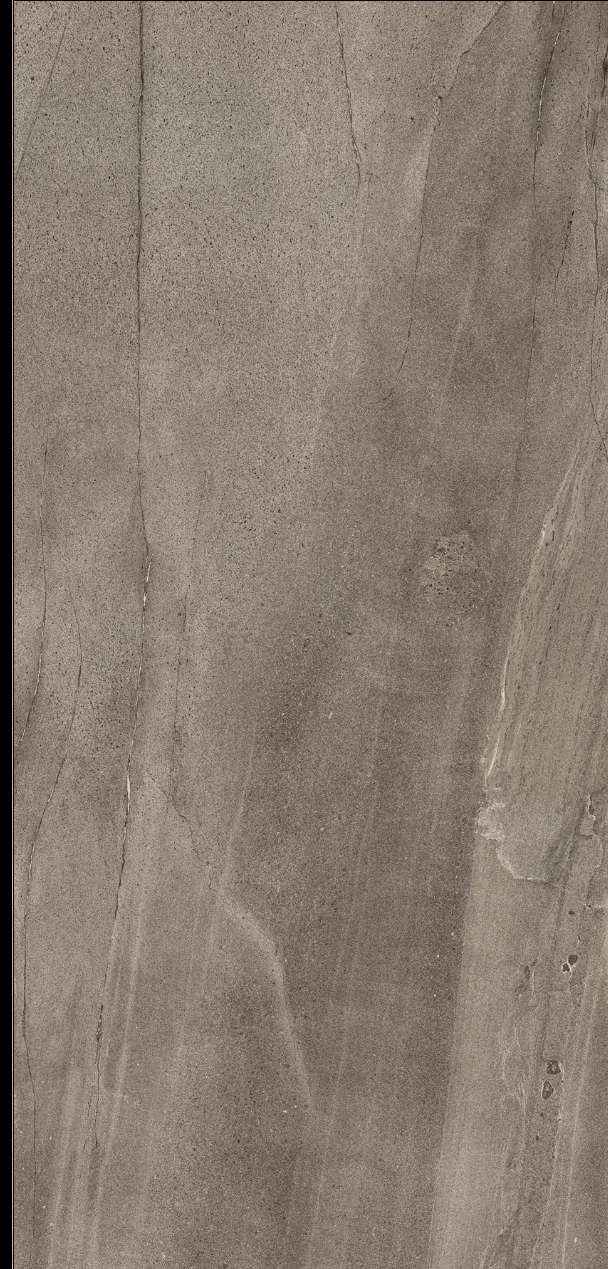
Basalt Stone Moka Basalt