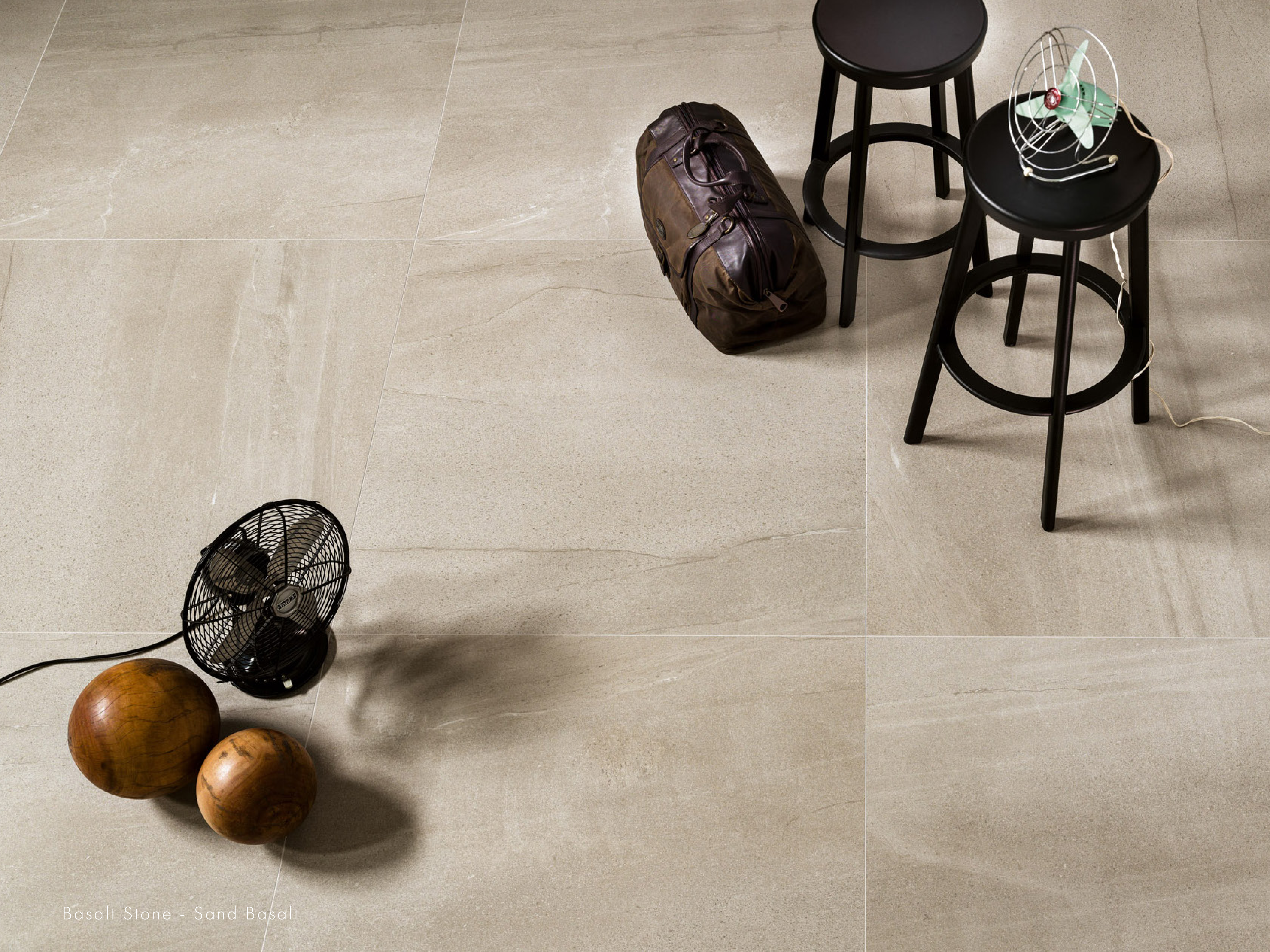
Basalt Stone - Sand Basalt