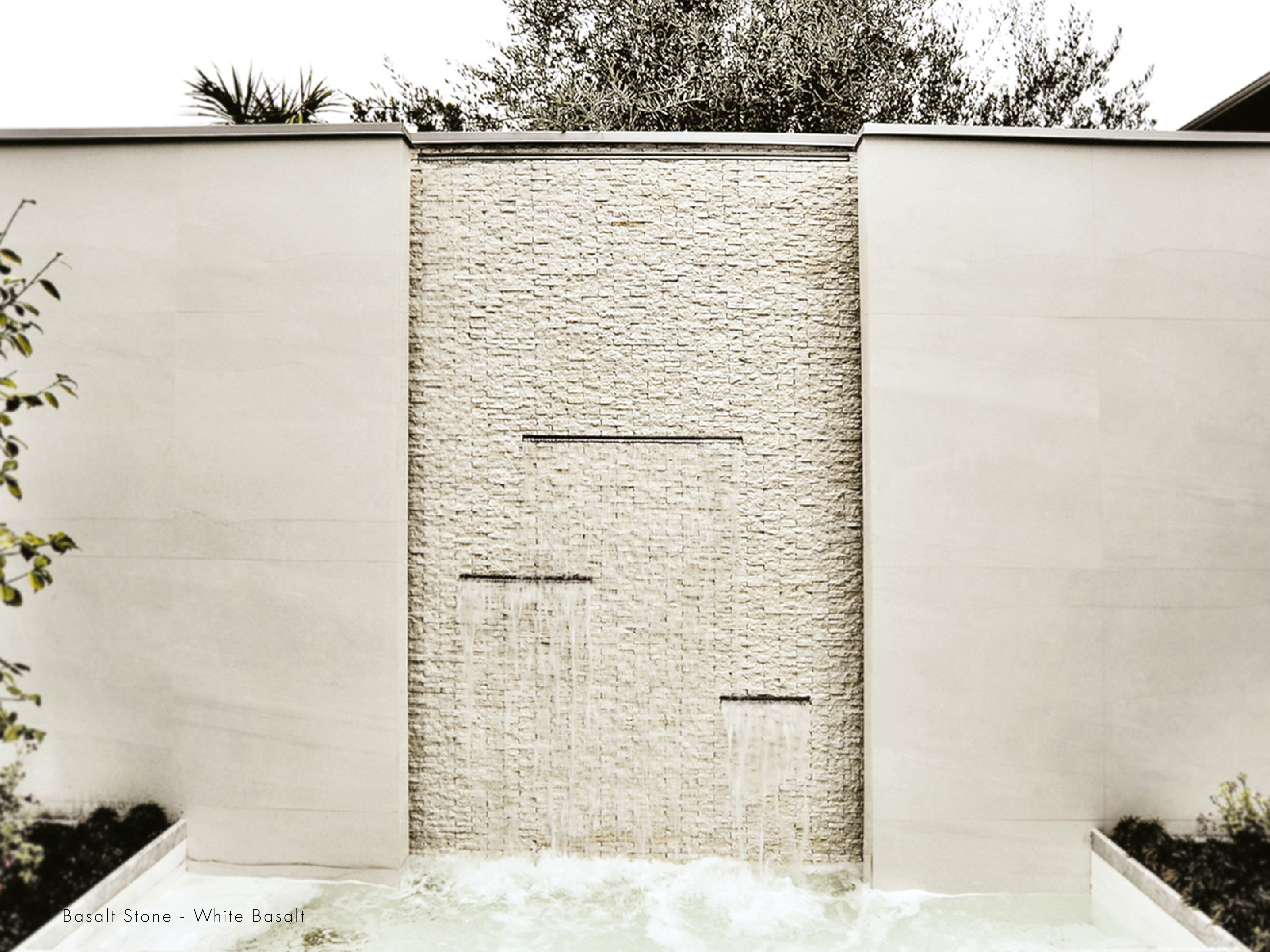
Basalt Stone - White Basalt