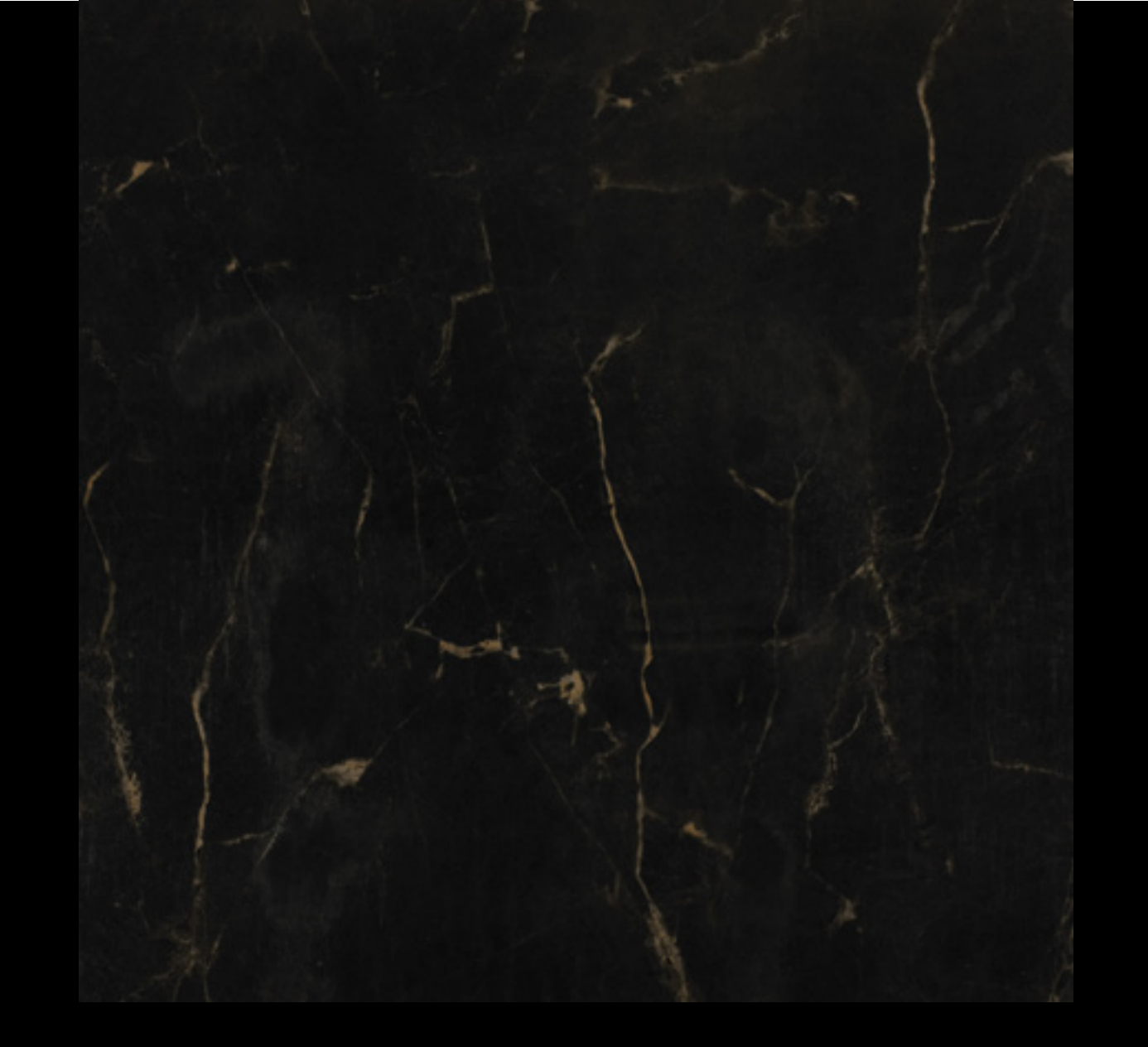
Classico Obsidian Black