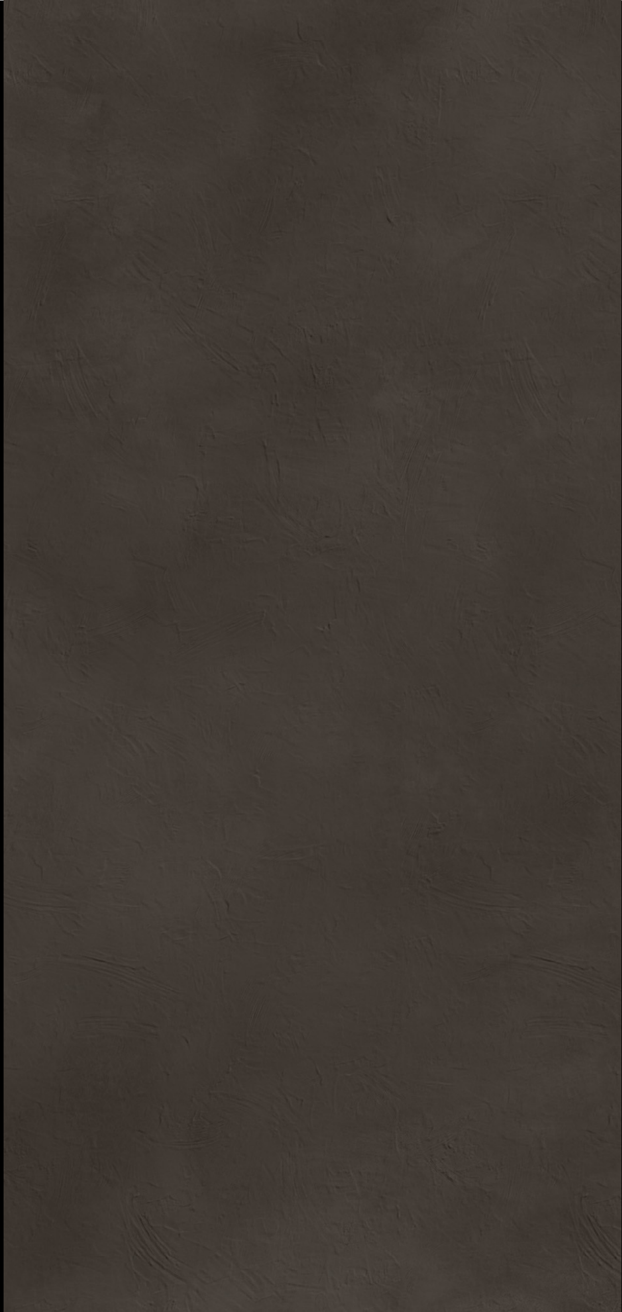
Resin Sense Marrone