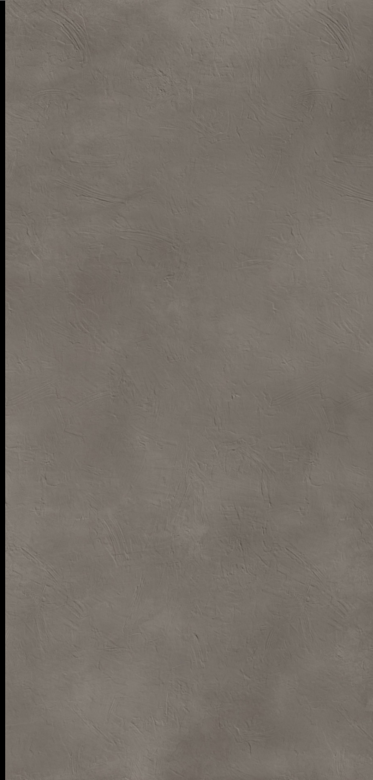
Resin Sense Viola