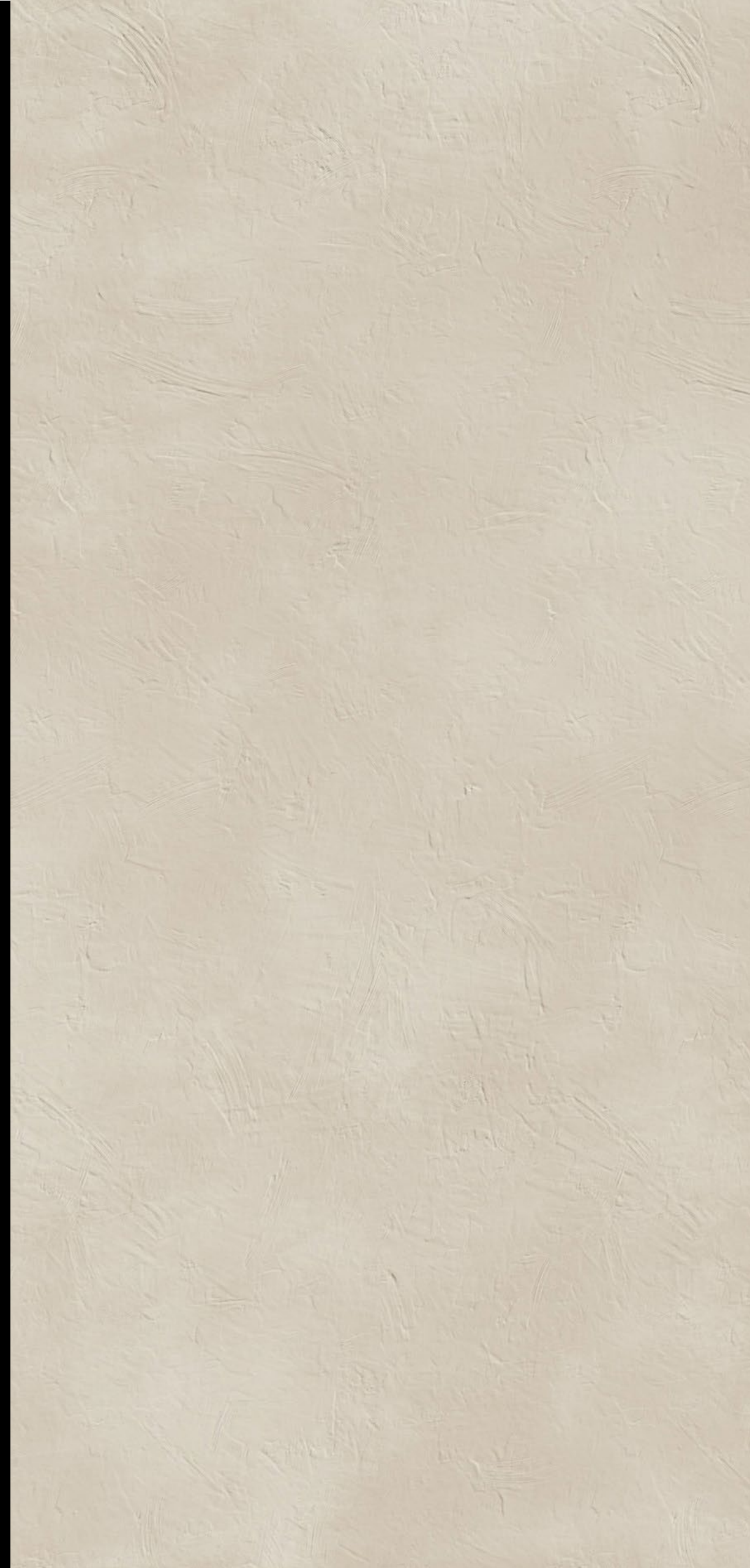
Resin Sense Lime