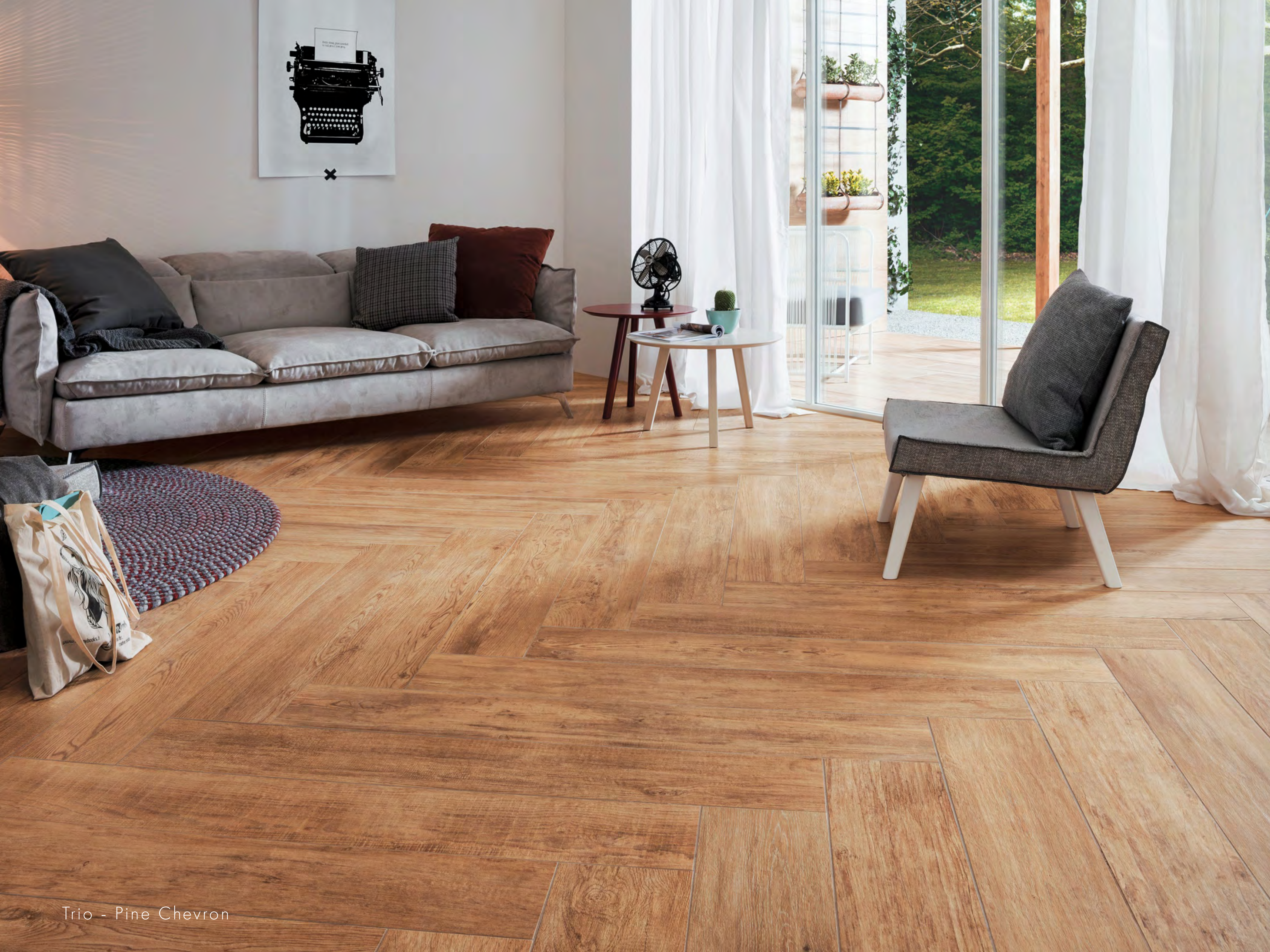
Trio - Pine Chevron