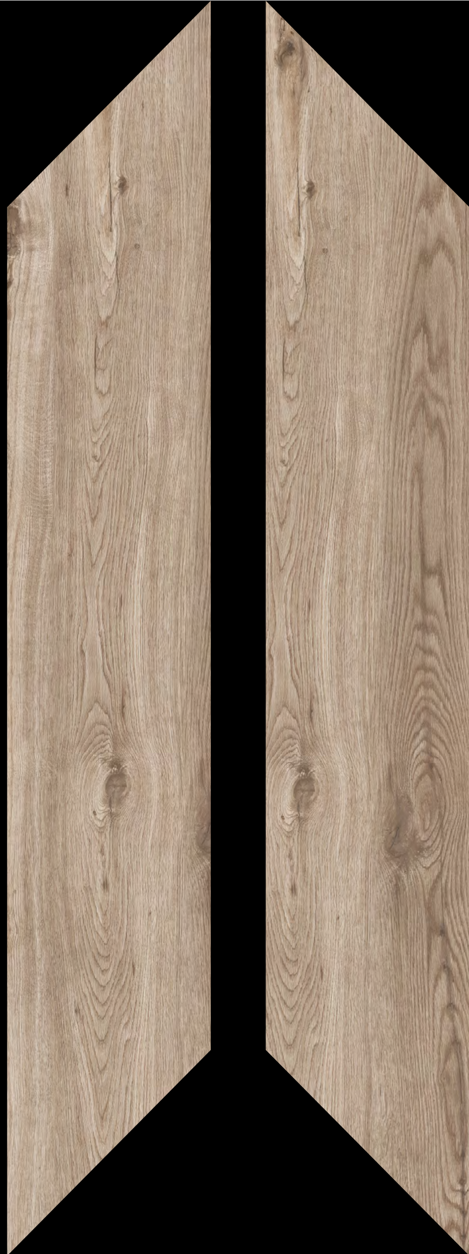
Trio Chevron (Camphor)