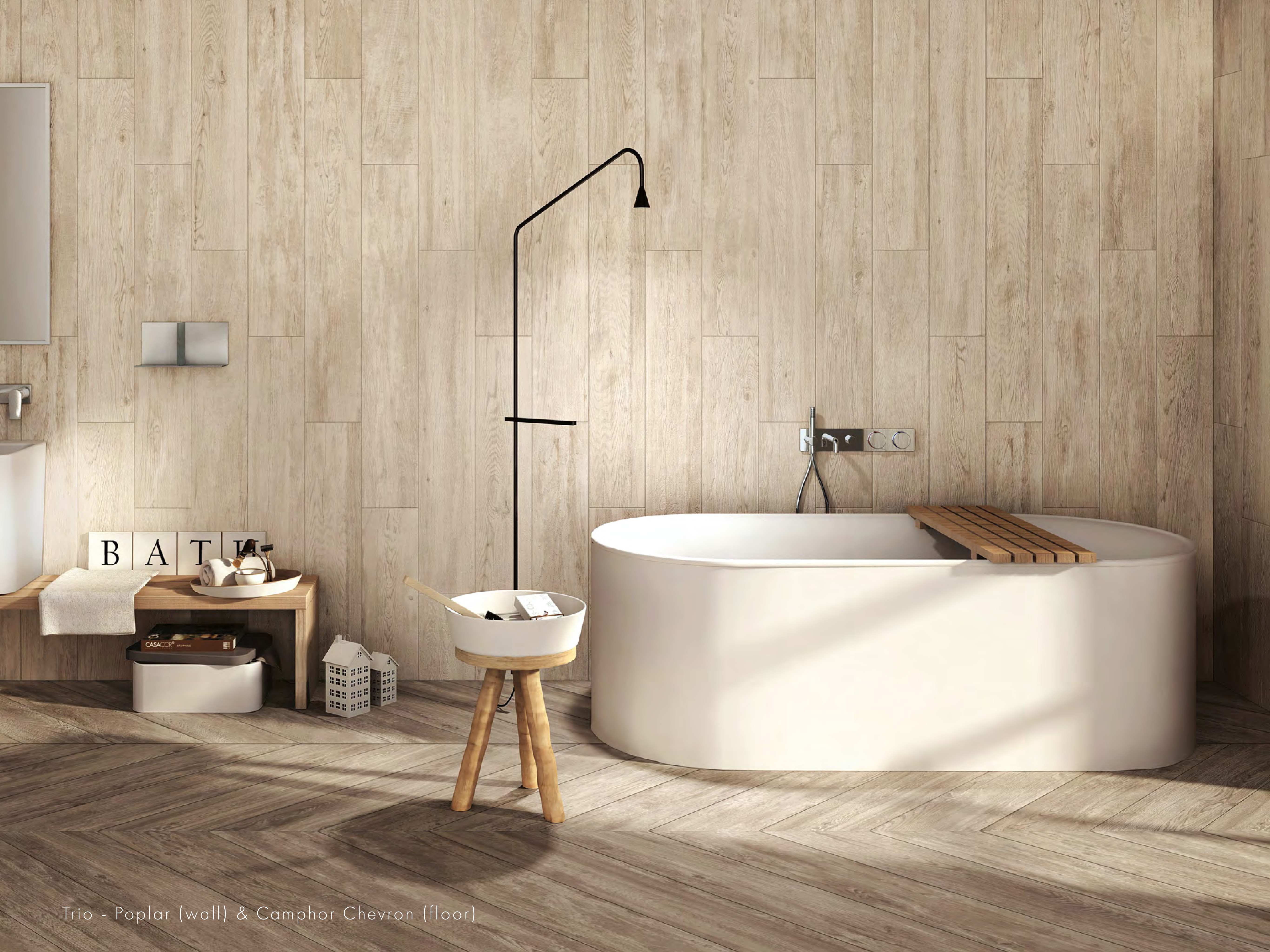
Trio - Poplar (wall) & Camphor Chevron (floor)